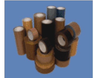
Coated fabrics PTFE tapes

impregnated with virgin PTFE. Coated fabrics PTFE tapes (PTFE silicone adhesive tapes) can provides a high temperature release surface for protection and insulation. Coated fabrics PTFE tapes (PTFE silicone